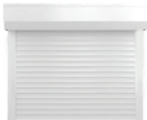
EA 44mm End Retention Aluminum Roll Shutter. Spans ranging from 5' to over 12' with loads from +-93 to +-40 respectively