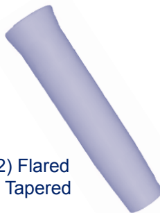
(2) Flared & Tapered